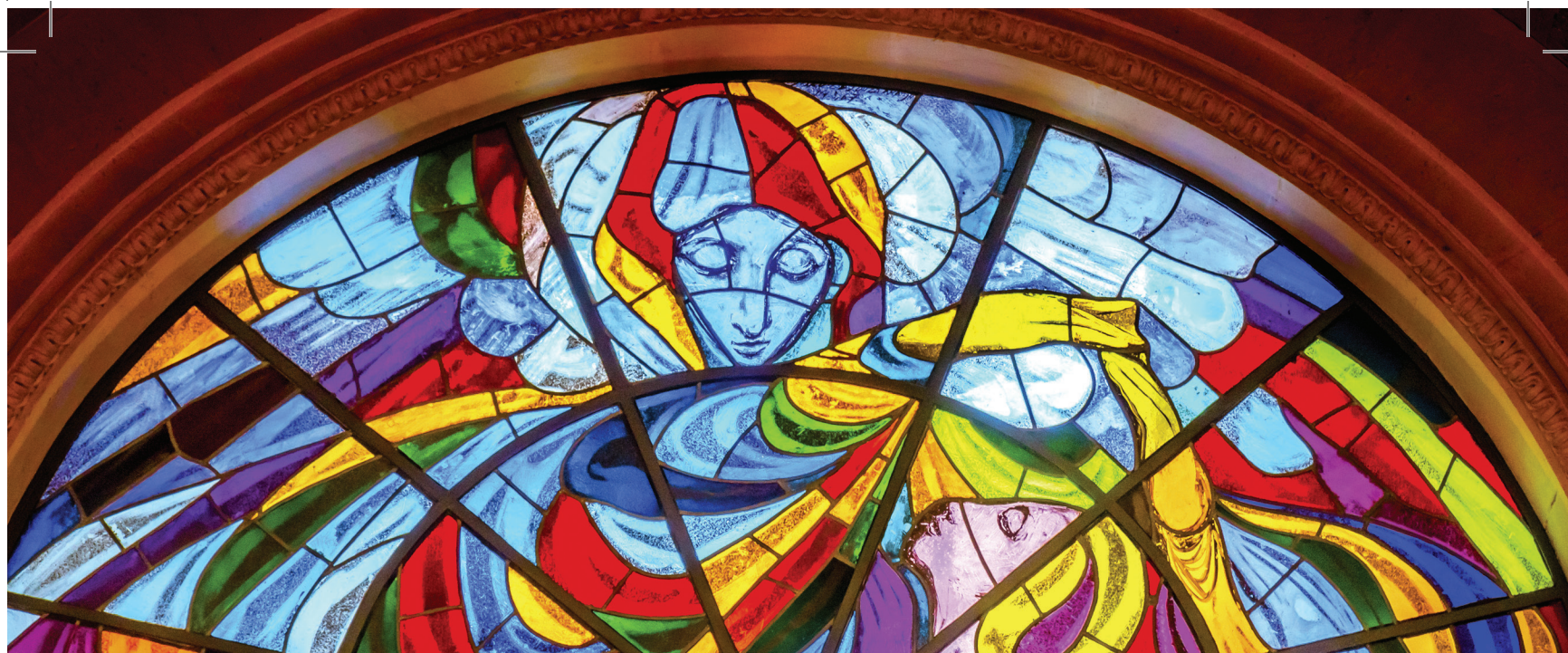
Our Lady in stained glass at The Basilica of Our Lady of Rosary in Fatima, Portugal, where three shepherd children encountered the Blessed Virgin. The Basilica was built in 1953.